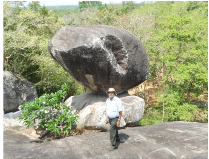
Figure 4: Erratic boulders at Nakolagane Temple site (coordinates 7°49'N, 80°19'E) both in Kurunegala District.

Between Kaduwela and Hanwella on the Kelani Ganga (Western Province), for example, a high-level gravel known as the “Malwana formation” is present at 16m above the present river level (28m above MSL); a lower gravel, the Ranale formation, is found at 6.5m above the present river level (23m above MSL; Photograph 6). The Malwana formation contains beds of well rounded, coarse quartz pebbles embedded in a matrix of laterite separated from each other by pebble-free layers of laterite. Remnants of this formation are seen capping the ridge that runs parallel with the river in Ranale and Nawagamuwa villages on the left bank of the Kelani Ganga (river), and at Mapitigama, Weelgama, Thittapattara, and Wiyalananda villages on the right bank of the same river (Cooray 1984).