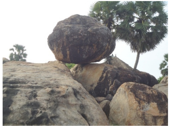
Figure 2: Showing erratic boulders at Uraniya (Pottuvil) Lagoon (coordinates 6°54'N, 81°50'E), 3m above MSL, East coast.

Erratic boulders at Kadigawa (coordinates 7°42'N and 80°00'E) and Kadigawa Temple area (coordinates 7°43'N and 80°00'E) in the Kurunegala District Northwestern Province are located on the Second Planated Surface. The area is 35 - 40m above the present MSL. Erratic boulders at Nakolagane Temple site (coordinates 7°48'N and 80°18'E, Photograph 4) and erratic boulders at Viharagala Temple site (coordinates 7°46'N and 80°28'E, Figure3) in the Kurunegala District, Northwestern Province are located above 120 to 200m MSL. The boulders of the Northwestern Province are derived from the rocks of Highland and Wannu Complexes. The Wannu Complex is composed mainly of quartzites, calc-silicate gneisses, cordierite gneisses, garnet-sillimanite gneisses, garnet-biotite gneisses, quartzofeldspathic gneisses, metagranites (including pink granites), granitoid gneisses, charnockites, meta-diorite, amphibolites, meta-gabbros, migmatites, monzo-diorite and pegmatites.