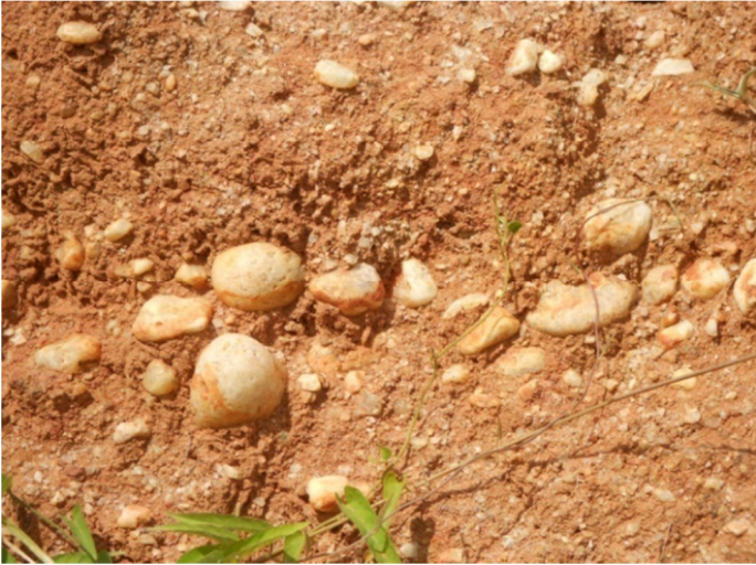
Figure 5: A gravel hummock at Leekolawewa (coordinates 7°42'N, 80°02'E), about 40m above MSL, in Northwestern Province.