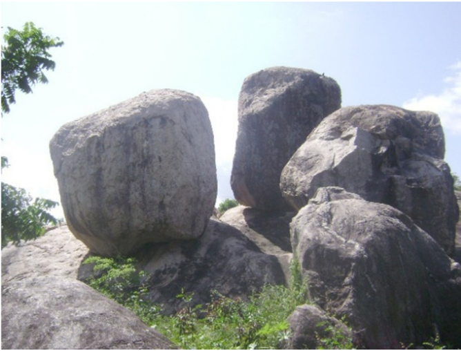
Figure 1: Showing erratic boulders at Tennamavadi (coordinates 8°58'N, 80°58'E), about 1.5 km southwest of Kokkilai Lagoon mouth, 15 -20m above MSL in Northeast coast.

ice-rafting. Ice-rafted debris or ice-rafted deposits and stream feddeposits were deposited onto the bottom of the water body, for example, onto a river bed or an ocean floor. Erratic boulders at Tennamavadi are located at coordinates 8°58'N and 80°58'E in Sri Lanka's Northeastern Coastal Zone very close to the present coast. The locality is about 15-20m above MSL and 1.5 km southwest of Kokkilai Lagoon mouth, (Figure 1). Colour and mineral composition indicate that the rocks are derived from the Highland Complex rocks. They are mainly quartzite, marbles, garnet-sillimanite-schist and charnockitic gneisses. The erratic boulders at Valaichchenai Lagoon (coordinates 7°56'N, 81°33'E), and Uraniya (Pottuvil) Lagoon (coordinates 6°53'N, 81°50'E) are about 2.0m - 4.0m above MSL (Figure2). The lithology of these boulders being composed of a heterogeneous group of gneisses, migmatites and granites with scattered sedimentary bands confirm the source to be Highland Complex rocks (Cooray 1984). The erratics exhibit rounded, oval and elongated shapes ranging in from pebbles to large boulders hundreds to thousands of metric tons in weight. These appear to have been dropped on rock outcrops or on the ground by melting glaciers moving in a northeasterly direction.