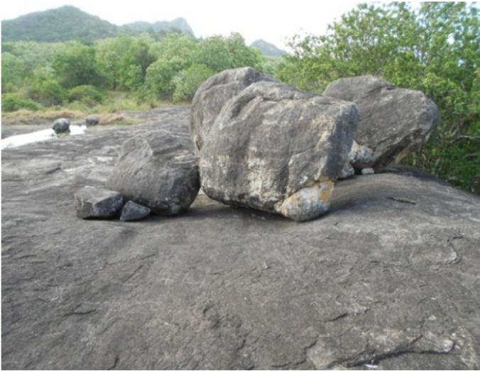
Figure 3: Erratic boulders at Viharagala Temple site (coordinates 7°46'N, 80°28'E).

areas and ferruginized, indurated gravel bearing deposits exposed at Erunwela, Muttibendivila, Pallama, Metiyagane and (in the subsurface of hummocks throughout the lower plains in the northwest (Wayland 1919, Coates 1935, Deraniyagala 1958, Cooray 1963 and 1984). The original transported materials were converted to iron-rich brown and reddish brown earth embedded with well rounded quartz gravel to pebble size are found in a hummocky area at Leekolawewa in the Kurunegala District (Photograph 5). The sizes of the well rounded and oval shaped pebbles and cobbles vary from 2.0 cm to 8.0-10 cm. This author believes that these sediments represent weather-worn outwash plain deposits produced at several stages during the glacial history.