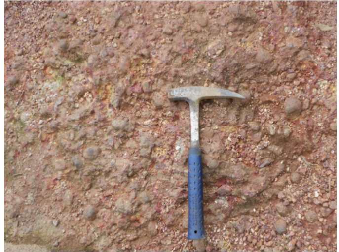
Figure 6: Ranale Gravel Deposit (coordinates 6°55'N, 80° 02'E), 22m above MSL in Western Province (as streams fed deposits)