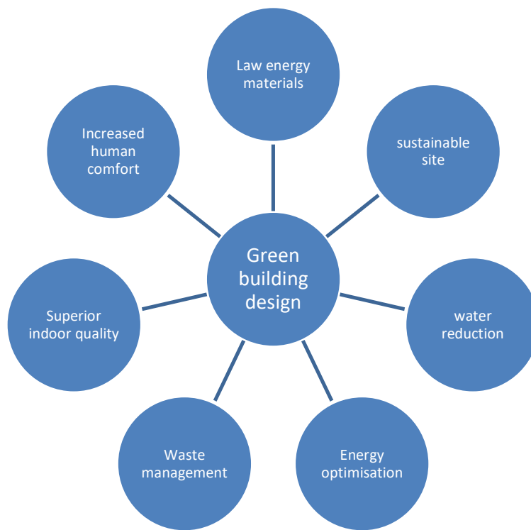
Figure 2: Components of green building designing

There are several components can be identified in the Green Environmental Planning (Figure 2). These components play a vital role when designing a green environment (Bombugala and Atputharajah, 2010).