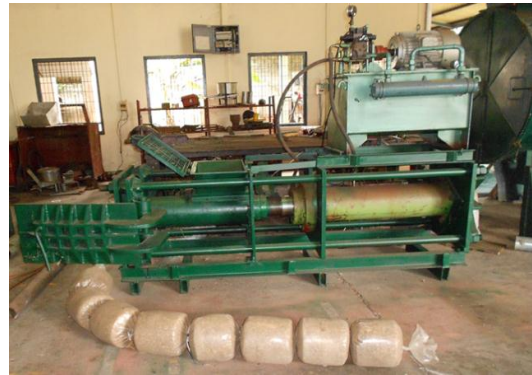
Plate 2. Block forming machine

Well mixed 5 kg raw feed ingredients were loaded to the hydraulic block forming machine (Plate 2) manually. Compressed blocks were formed by applying 120 psi hydraulic pressure for 4 minutes. Feed blocks were packed in polyethylene covers and sealed immediately and stored under proper storage.