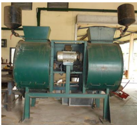
Plate 1. Feed mixer

Feed samples (100 g) were collected from each 50 kg bulk mixtures separately. Collected feed samples were dried and ground to pass through a 1 mm mesh and stored in sample bottles until further analysis. All feed samples (from B1, B2, B3 and B4)