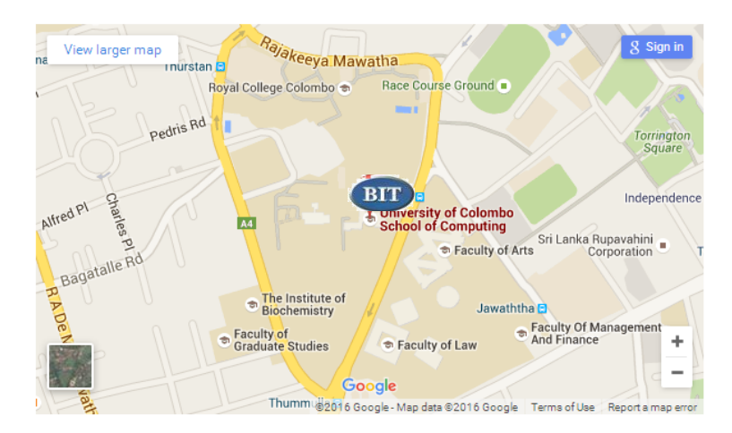
Figure 2: External Degrees Centre (EDC) of the UCSC

External Degrees Centre (EDC) is located at the UCSC Building Complex at No. 35, Reid Avenue, Colombo 07. Refer Figure 2 for the location of the BIT office.