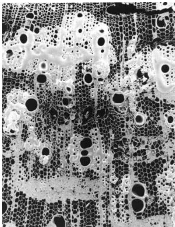
Figure 1. Photomicrograph of the agarwood (white colour areas) produced tree stem.

dbh = diameter at breast height, that is, 1.3 m above the ground.