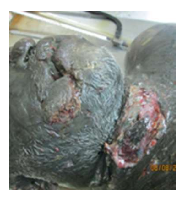
Figure 6. Neck injuries simulated cut throat