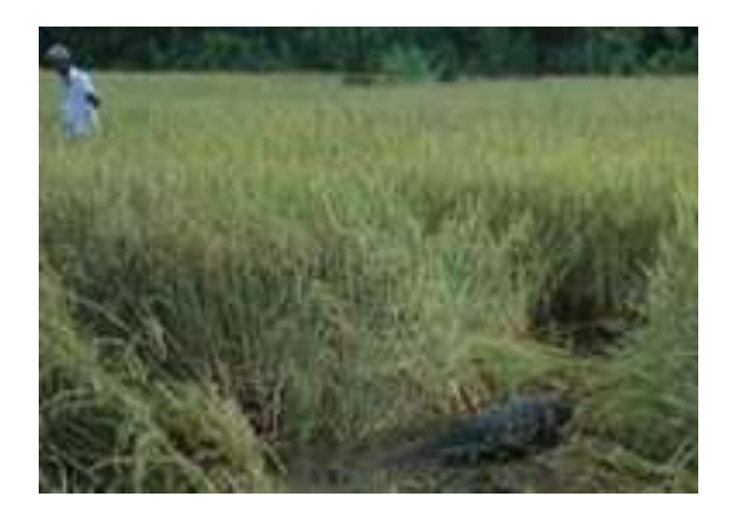
Figure 4. Followed the path of water monitors.