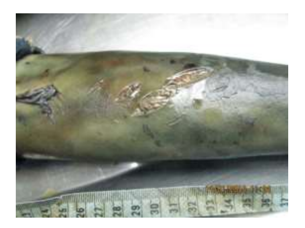
Figure 2. Limb injuries simulated cuts