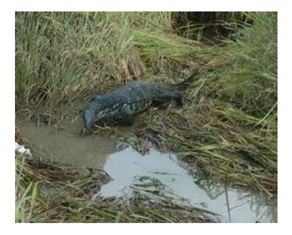
Figure 5. Ultimately found the site of the body