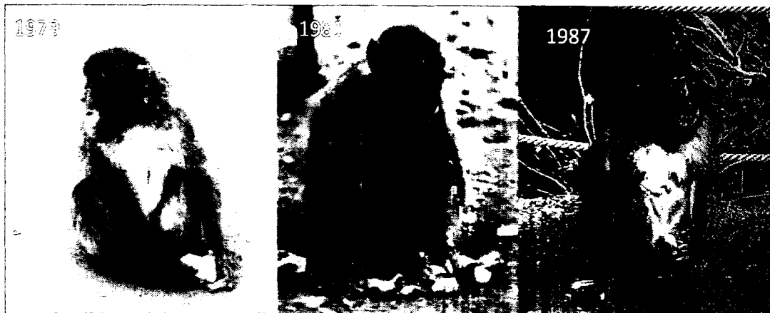
Figure 2. Initial transmission of SH behaviour from key innovator, 3.5 year-old female Glance 6476 to other kin-group members.

behaviours confirmed that SH was practiced into old age in some of these troops as well (Leca et al., 2007b), however due to management practices of the captive SH troops under study, it is not possible to introduce non-SH individuals into a SH troop to see whether or not it is possible to acquire the behaviour as adults.