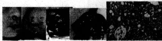
Case 3- Fig.8, 9, 10, 11 and 12 show bleeding at nose, umbilicus, scalp and lungs