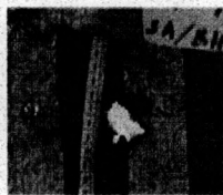
Fig. 2. Entry on shirt