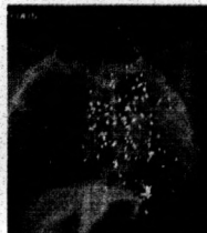
Fig. 4. Downward distribution