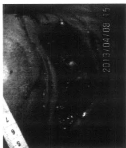
Fig. 2. Deep cut throat of father.