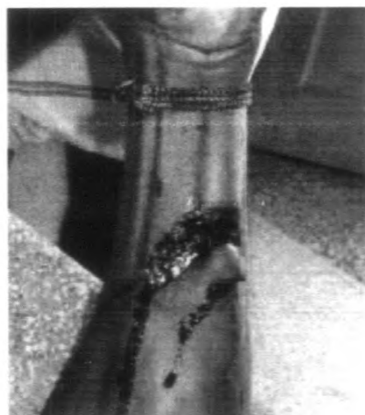
Fig. 3. Defense injury of father.

on face and a deep defense cut on the left forearm (Fig. 3). Blood samples were sent for toxicological analysis. Causes of deaths were cut injuries to the neck.