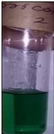
Fig 1: Reducing power of peanut butter fruit extract

Reducing power of peanut butter fruit extract was checked as a qualitative test to confirm whether antioxidant substances contain in the peanut butter fruit extract by observing the colour change.