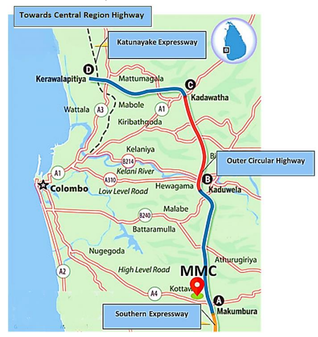
Figure 3: Location of the Study Site